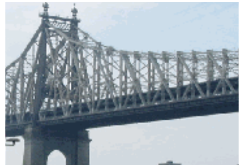
Queensborough Bridge, NYC