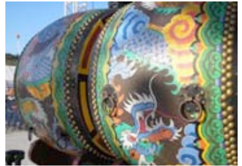
Seoul, South Korea